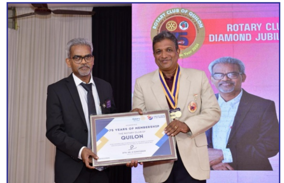
Congratulations to RC Quilon who are celebrating their Diamond Jubilee year.