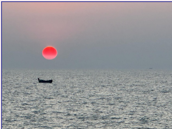
Sunset at Edava Beach

Tongue-in-Cheek Actual sign inside the parking lot of a shopping mall