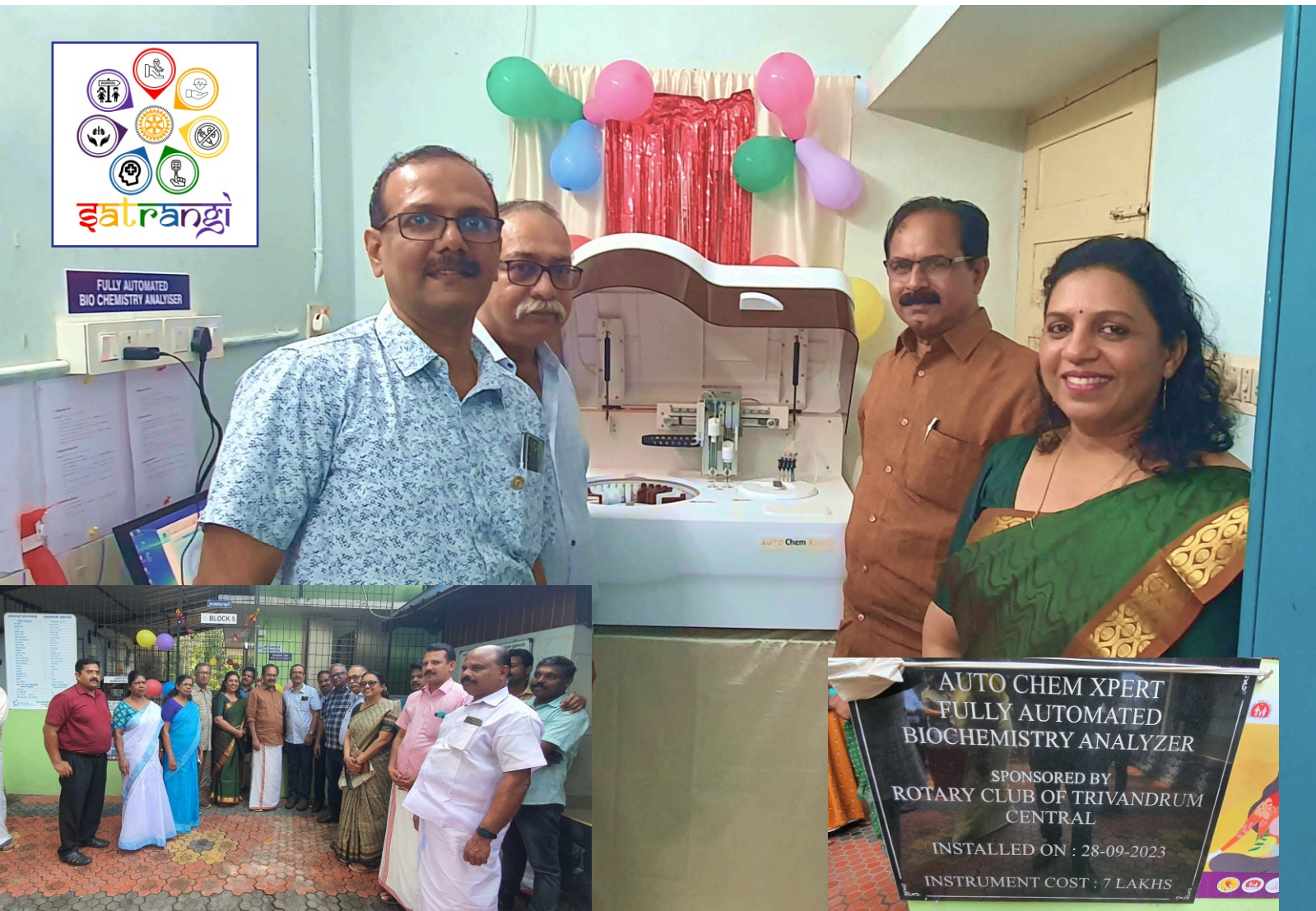
Under SATRANGI Project, RC Trivandrum Central installed a Biochemistry Blood Analyser worth Rs.7 lakhs at Primary Health Centre, Palode to facilitate diagnostic tests for the patients.